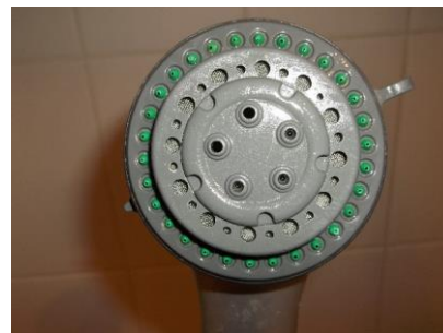
Example of a Shower AFTER Cleaning, Disinfection and Descaling

Envirocure Ltd recommends that a Legionella risk assessment, cold water storage tank and shower clean and disinfections are carried out on each property for existing tenants, and prior to habitation by new tenants.