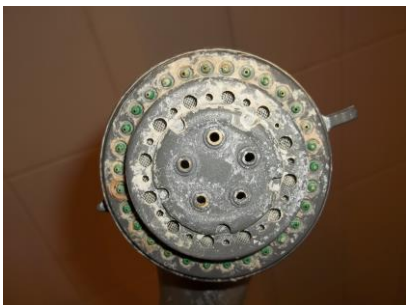
Example of a Shower BEFORE Cleaning, Disinfection and Descaling

Another common issue within water systems is contaminated shower heads. When showers become dirty and scaled, the risk from Legionella bacteria increases. This is due to the presence of known Legionella food sources and the increased risk of atomisation of contaminated water particles due to excess scale on shower heads.