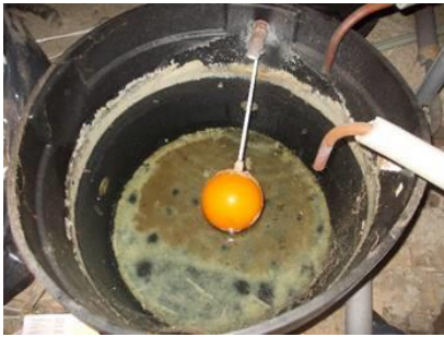
Example of a Cold Water Storage Tank BEFORE Cleaning and Disinfection

Pictured below is an example of the common conditions found in water systems within domestic properties. A Legionella risk assessment would identify this as non-compliant and in need of cleaning.